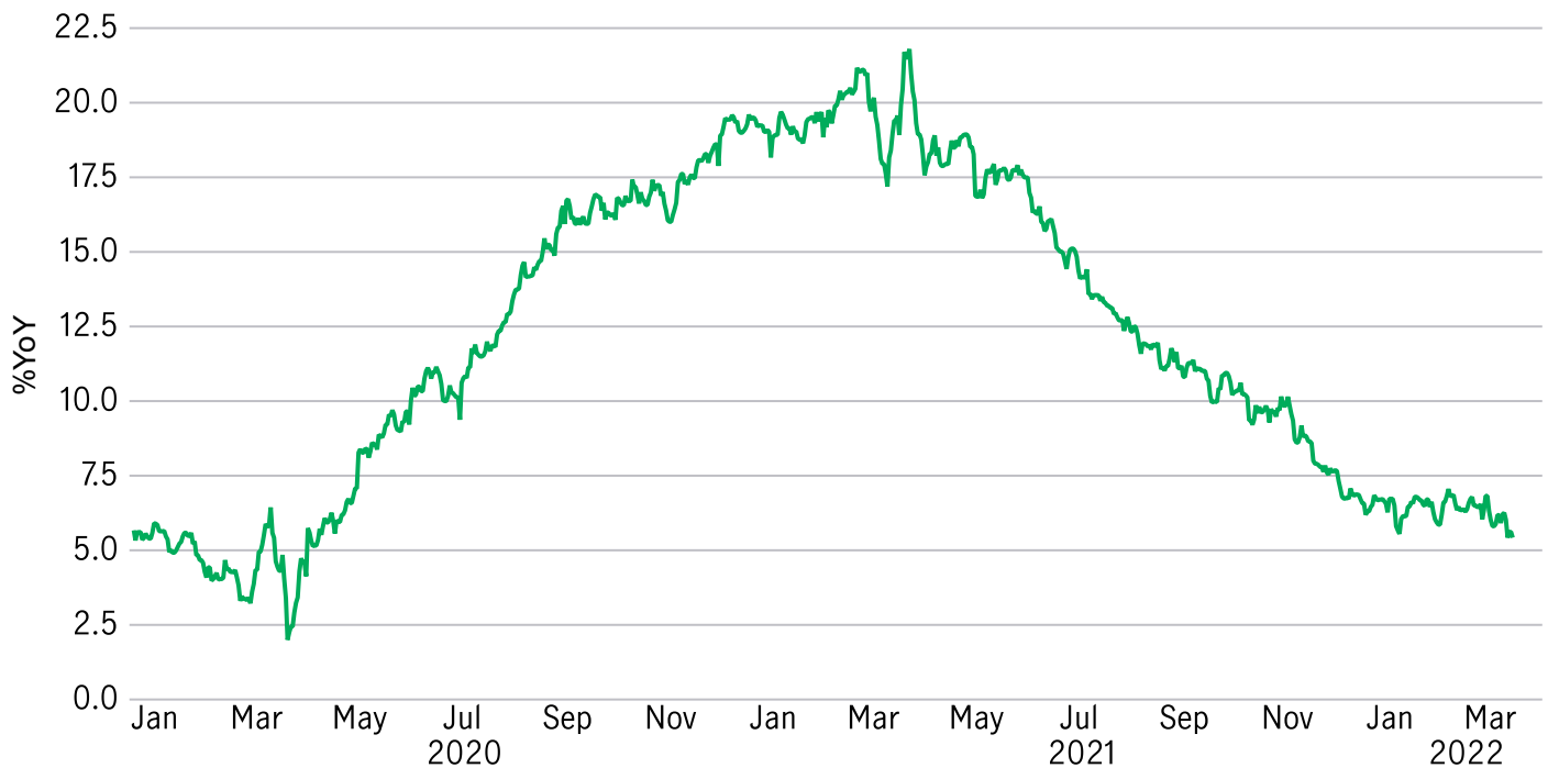
Chart 1: Annual growth in global money supply

Source: Bloomberg, Macrobond, Manulife Investment Management, as of 14 March 2022. YoY refers to year over year.