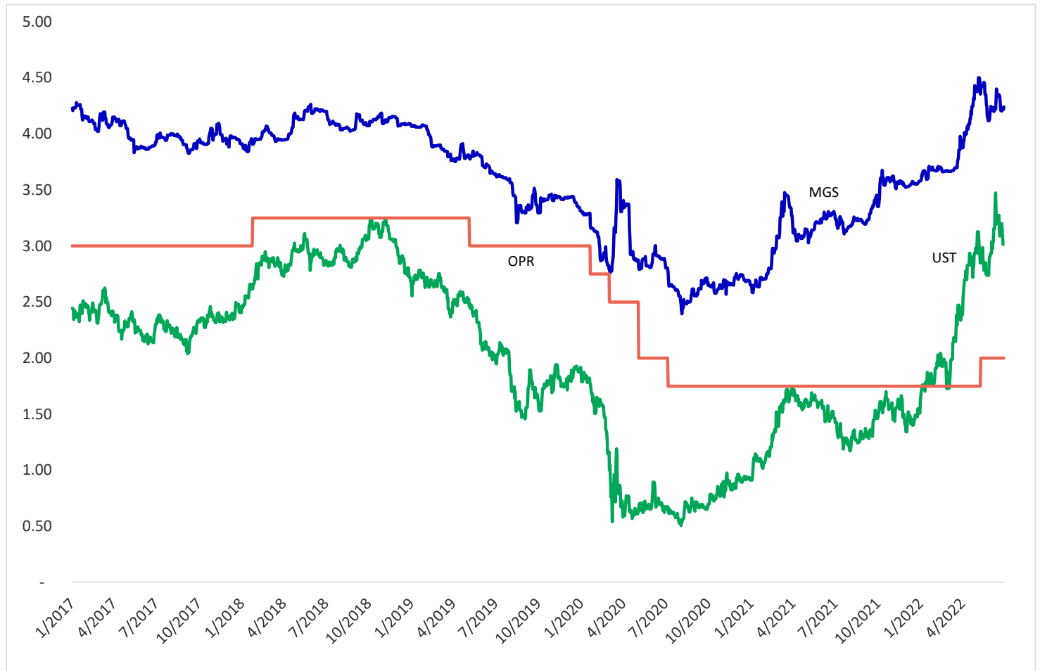
Chart 3: MGS yield, UST yield and OPR (1 January 2017 – 30 June 2022)

We maintained a defensive portfolio for our fixed income funds for most of 2021 and 1H 2022, with higher cash level and shorter portfolio duration. We have gradually lengthened portfolio duration recently after yields have realigned higher.