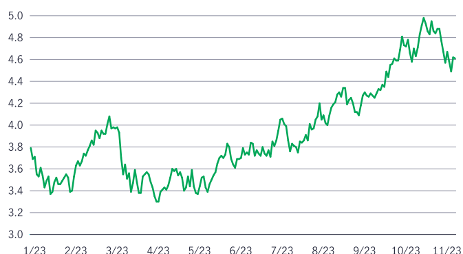
10-year U.S. Treasury yield (%)

Source: U.S. Department of the Treasury, as of November 13, 2023.