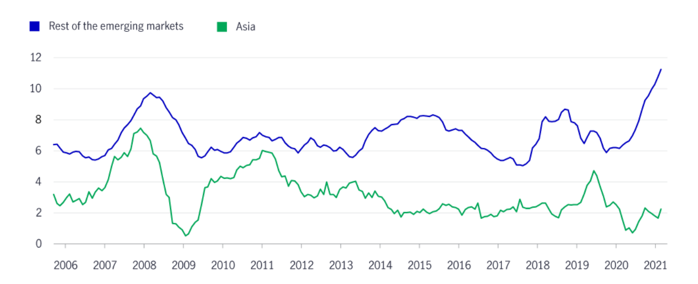
Chart 3: Inflation in Asia has decoupled from other emerging markets Year-over-year change in CPI in Asia and emerging markets (%)